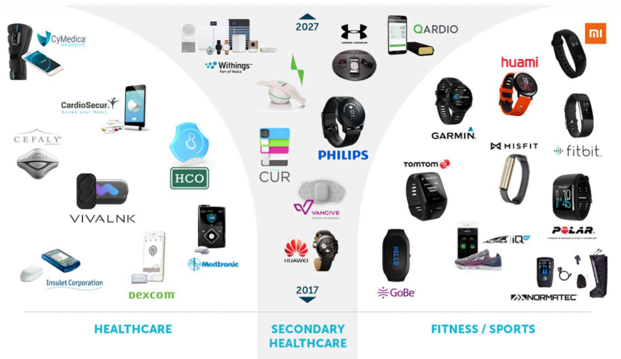
Figure 1. Overview on the wearable market as defined by Wearable Technologies

( http://www.wearable-technologies.com ).