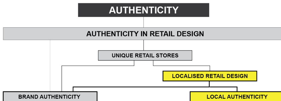
Figure 1. Degrees of authenticity in retail design

In the process of localising retail design, two degrees of authenticity are to be mediated: authenticity to the brand and authenticity to the place. Figure 1 indicates varying degrees of authenticity and emphasises that the authenticity of localised retail design is conditional upon both brand and local authenticity.