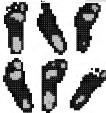
Figure 2. Representative 6 peak pressure steps plantar pressure of the total 24 analysed from infant 2.

Median peak pressures across the total foot and all steps for each infant ranged from 105-165 kPa with IQRs of 35-92.5 kPa. Total foot peak pressure values ranged from 70-330 kPa across all steps and all infants.