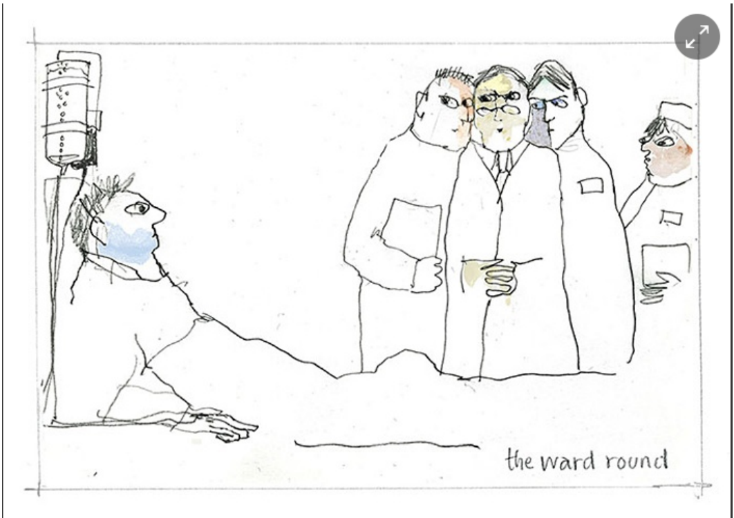
Figure 4. The Ward Round by Nick Wadley, 2012