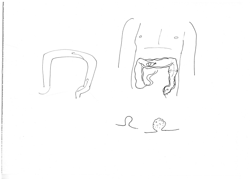
Figure 2: Exemplar drawings of the large bowel and detail of polyps, of the type drawn by a nurse for a patient on an endoscopy unit. Made by a Research Nurse during a research interview. Lyon and Turland, 2016.