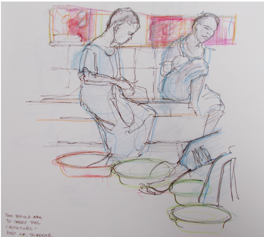
Figure 6. Jac Saorsa, image from blog post 'Ward round and portraitures', 14 th December 2014.