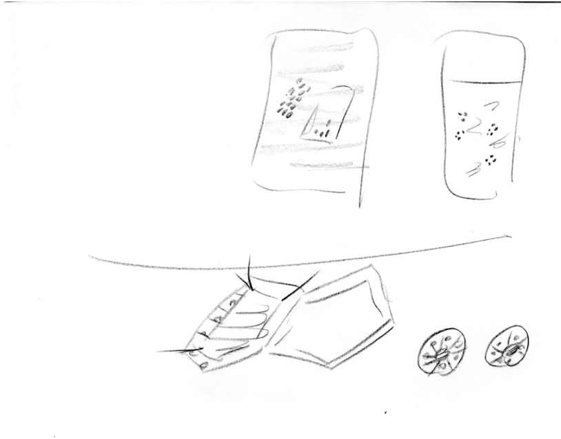
Figure 1. Exemplar drawings of slide sample and cells, of the type produced in discussion with trainees and/or medical students. Made by the Consultant Histopathologist during a research interview. Lyon and Turland, 2016, accepted for publication.