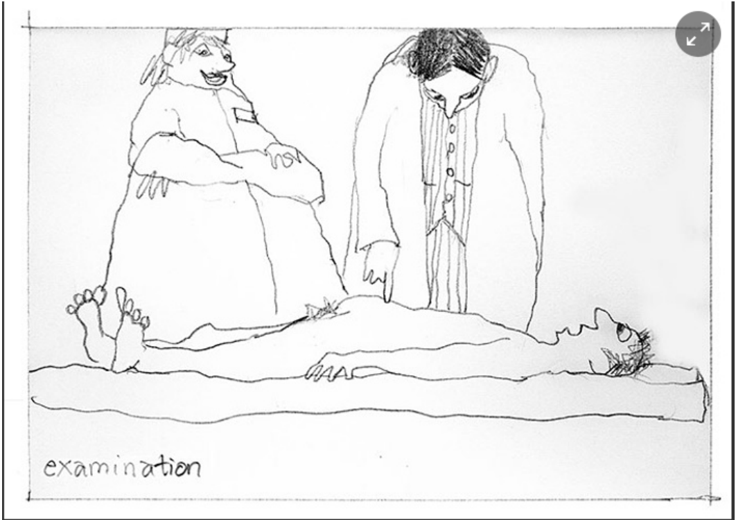
Figure 3. Examination by Nick Wadley, 2012