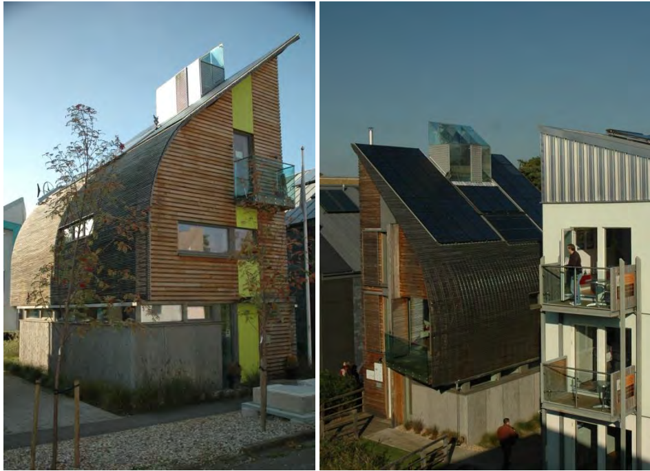
Figure 2: Kingspan Lighthouse