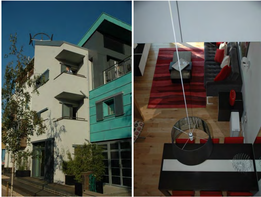
Figure 3: Barratt Green House