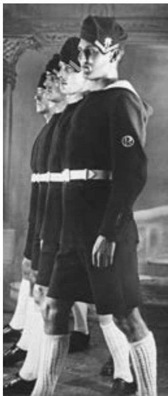
Above: the remodelled Kibbo Kift uniform, marking a shift in the organisation's identity, 1931. Right: Green shirts graffiti, 1937.