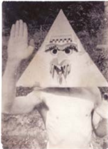
Spirit Mask, c.1928.

BY 1932, every one of these promises had been broken and yet, to Hargrave, continuity remained, even with the transformation to full political status as the Social Credit Party, which is what the remains of the Kibbo Kift would eventually become in the late 1930s. Although the Green Shirts and Social Credit Party groups still camped at annual National Assemblies throughout the 1930s, their methods moved towards more explicitly political forms of expression, including graffiti, throwing bricks and firing arrows through the windows of 10 and 11 Downing Street and burning effigies of Montagu Norman, the Governor of the Bank of England. This shift was not just a product of Hargrave's particular personality traits; many peace movements constructed in the utopian moment after the Great War shifted to a more hard-line position by the 1930s, following the dramatic economic turbulence of the 1920s and the rise internationally of political extremism.