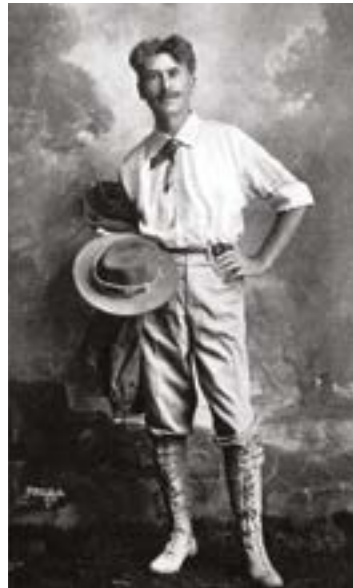
Ernest Thompson Seton, early 20th century.

For conservatives such as Baden-Powell, the spectre of Hargrave's political leanings hung over him like an ominous red cloud