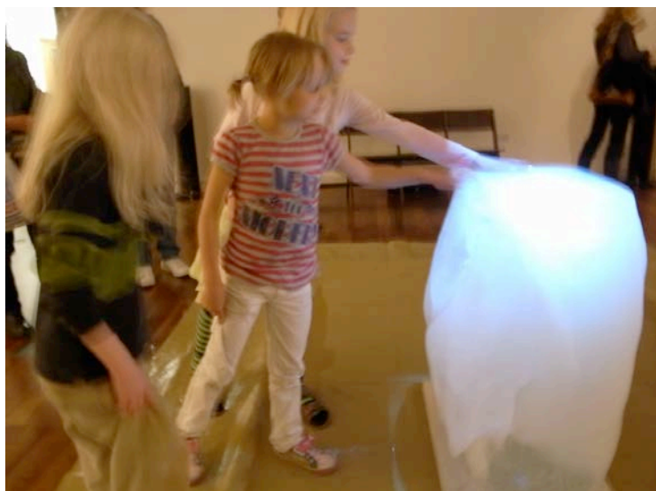
THE BREATHING CITY, Ice -Traffic Installation