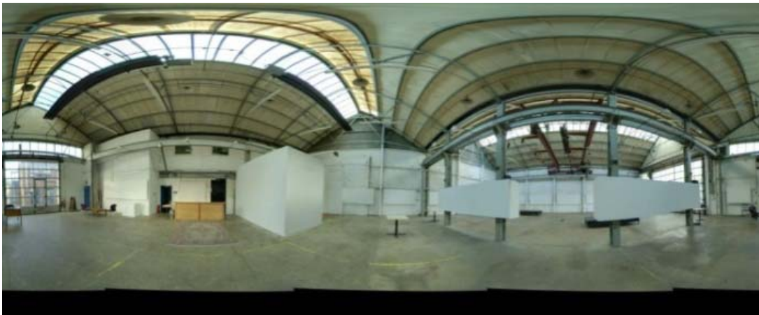
Figure 1 Final tone mapped HDR panorama of an interior scene.