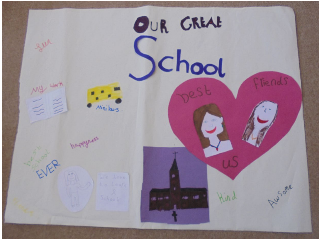
Figure 2. Collage from Woodington – example B.