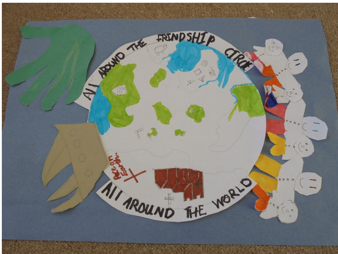
Figure 3. Collage from Fringefield – example A.