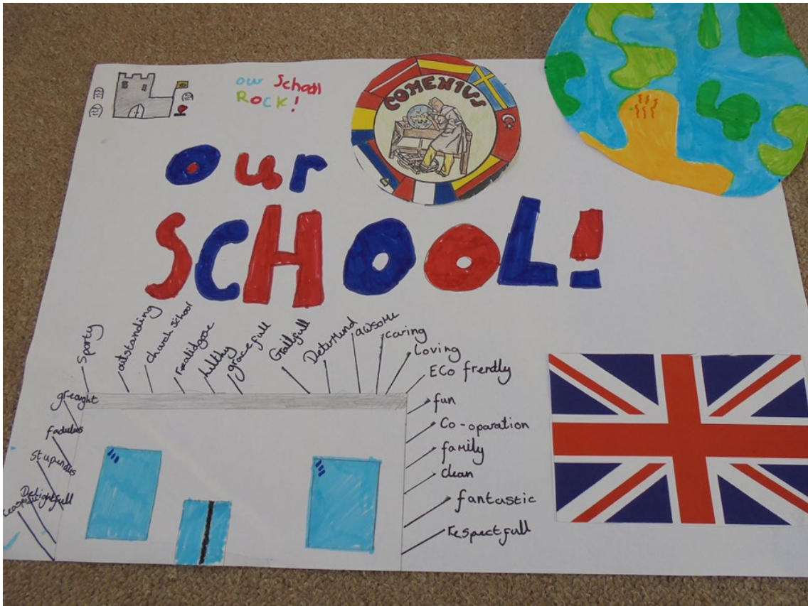
Figure 4. Collage from Fringefield – example B.